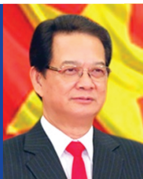
H.E. Nguyen Tan Dung

Prime Minister of The Socialist Republic of Viet Nam