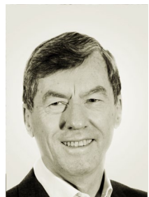
EINAR STEENSNAES , Former Minister of Petroleum and Energy and former Member of the Norwegian Parliament

Einar Steensnæs was born in 1942 in Haugesund, Norway. He graduated in 1968 at Oslo University and holds a degree in Physics (thesis), Mathematics, Geography, and Computer Science.