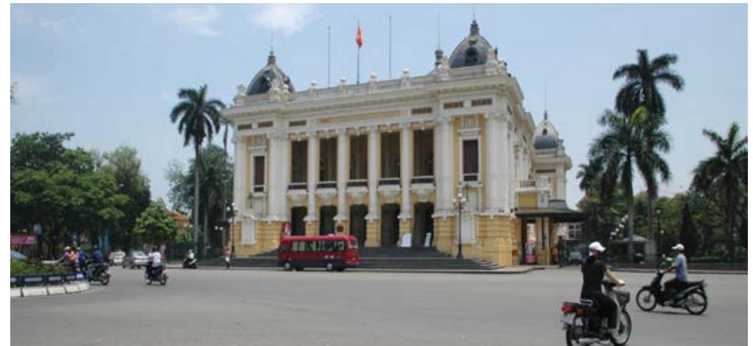
National Opera House