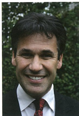
Dr Richard Susskind OBE

Following a coffee break which gave delegates a chance to mingle and network, a host of engaging workshops ensued and these included Davis Polk & Wardwell and Luthra & Luthra's presentation of the legal issues flowing from India, Shook Lin & Bok's presentation on Effective Arbitration Clauses and the Setting Aside of Awards and Stamford Law Cor-