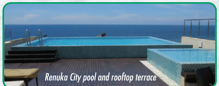
Renuka City pool and rooftop terrace