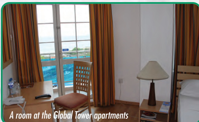
A room at the Global Tower apartments

Shuttle bus services are being provided during the conference period to the BMICH Congress Centre, both from the city hotels, and from Mount Lavinia, which is slightly further away to the south. The journey time is likely to vary between 20 and 30 minutes, depending on traffic.