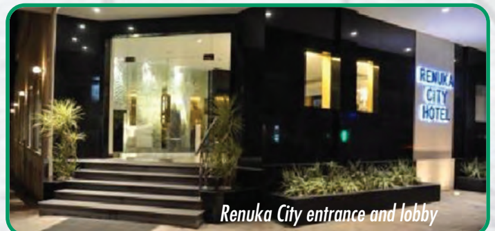
Renuka City entrance and lobby