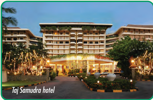
Taj Samudra hotel